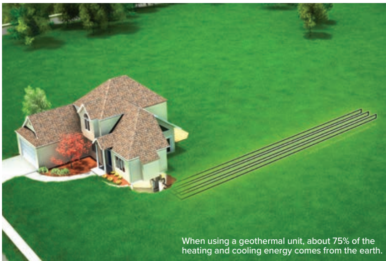
When using a geothermal unit, about 75% of the heating and cooling energy comes from the earth.

...Electric Heat is Expensive to Operate