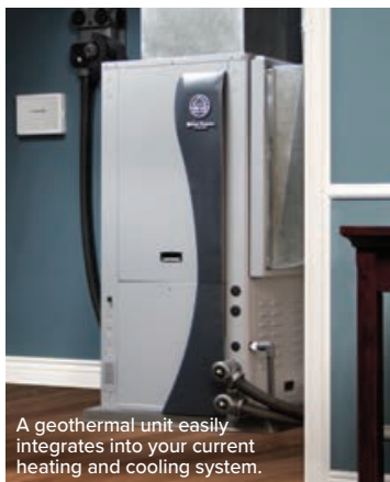
A geothermal unit easily integrates into your current heating and cooling system.

Since geothermal heat pumps are 100% electrical, there is no combustion of gas or oil in the home for heating. So, there’s no chance of smelly fumes, explosions, or carbon monoxide poisoning. Because heat pumps are certified by independent laboratories, they include safety cutoff switches for every circuit in the system.